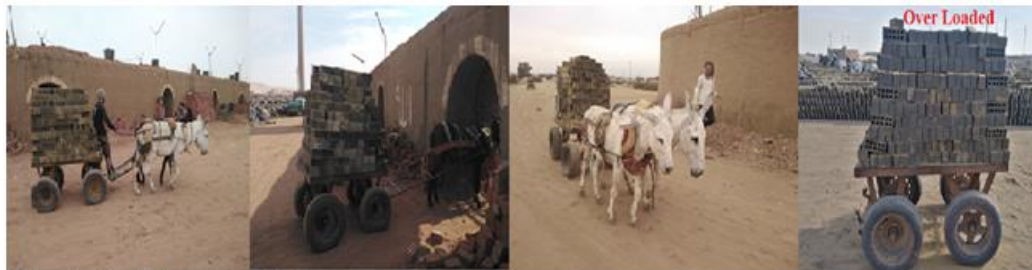
Fig. 4: Brick overloaded