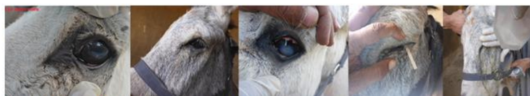
Fig.2: Eye physical examinations