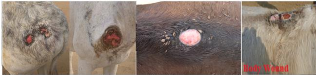
Fig.3: Different types of wounds; harness wound and beating wound