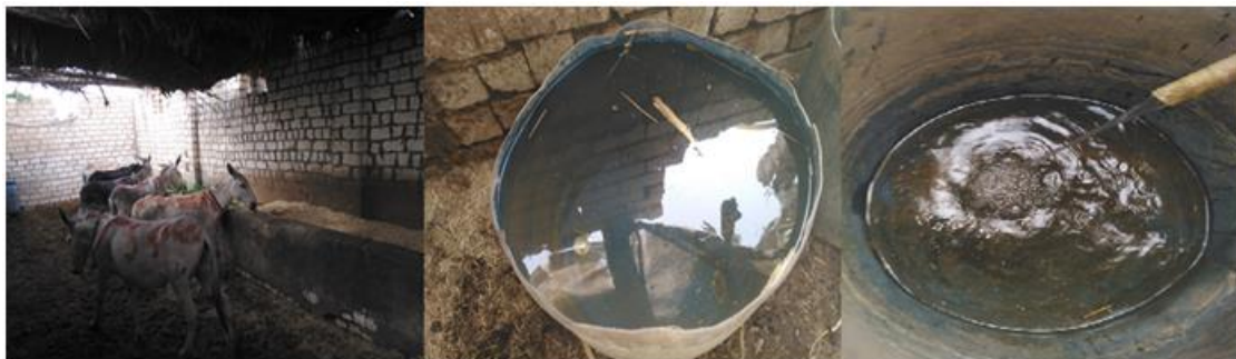
Fig. 5: Donkeys housing and drinking water source