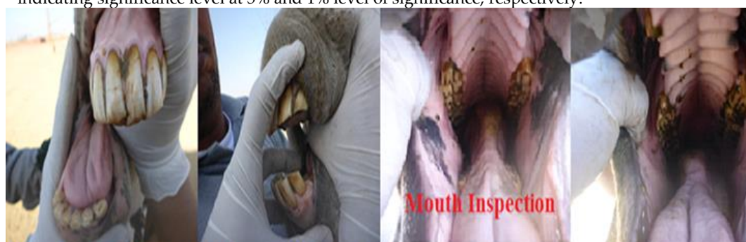
Fig. 1. Mouth physical examination

* and ** indicating significance level at 5% and 1% level of significance, respectively.